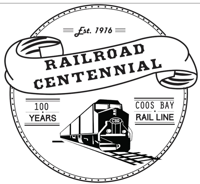
Pictured Above: Official Railroad Centennial Logo

At 7 PM the day before the event, OIPCB staff was notified that the first train would be late. OIPCB staff had to notify all customers on the first train ride that their rides had to be moved to a later time. Despite the hiccup, the event kicked off at 10 AM on August 5th with North Bend Day. It continued until August 7th ending with a Closing Ceremony. A full schedule of events can be accessed on <a href="https://eventmobi.com/coos-rail2016">https://eventmobi.com/coos-rail2016</a>.