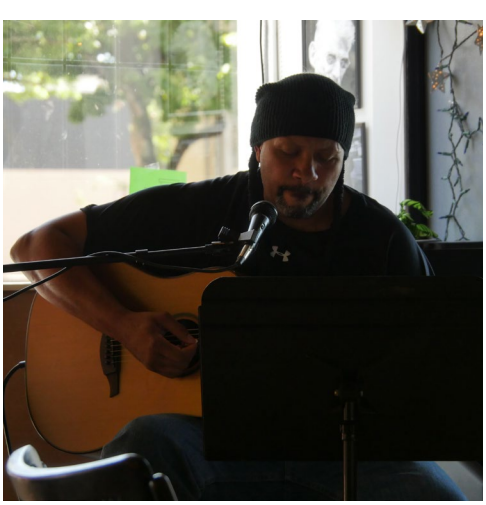
Pictured Above: One of the musical performances for the Music Train event

It was a month of design. OIPCB worked with BNT promotions to complete designs for the Railroad Centennial merchandise which included t-shirts, hats, USB drives and water bottles. OIPCB started to carry out the marketing plan which meant scheduling ads, press releases, and media appearances and designing promotional material.