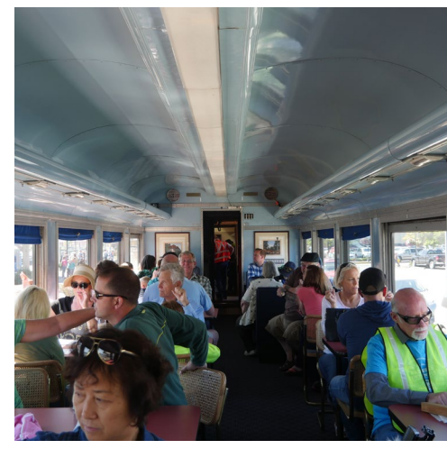
Pictured Above: Passengers enjoying the train ride along the Coos Bay rail line

Digital means were a primary mechanism for disseminating information about the event. OIPCB began working on an event app with Eventmobi. This app contained the event agenda, maps, speakers, and attendee profiles and was available for download in the app store or accessed online.