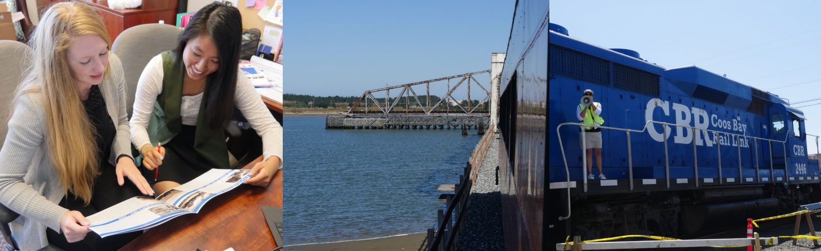
Pictured Above: OIPCB staff working on the planning the Railroad Centennial