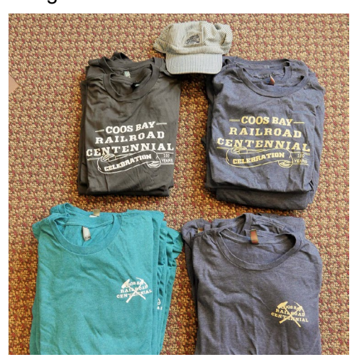
Pictured Above: Railroad Centennial merchandise, T-shirts and hats

OIPCB involved the community for selecting a 100th Anniversary Logo through social media and e-mail blasts. OIPCB sent out three logos designed in-house which the com-