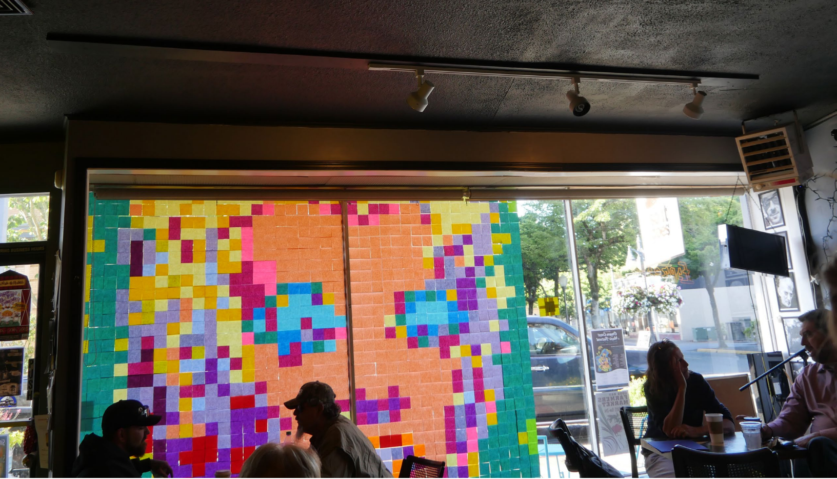
Pictured Above: So-It-Goes Coffeehouse illustrated Marilyn Monroe by Post-It notes as part of the Coos Bay downtown Post-It Wars