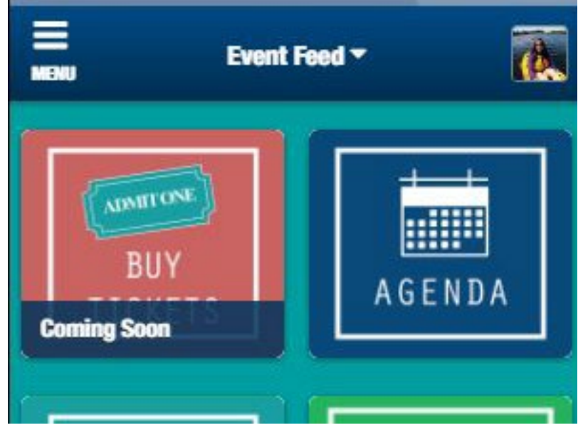
Pictured Above: Railroad Centennial event app home page