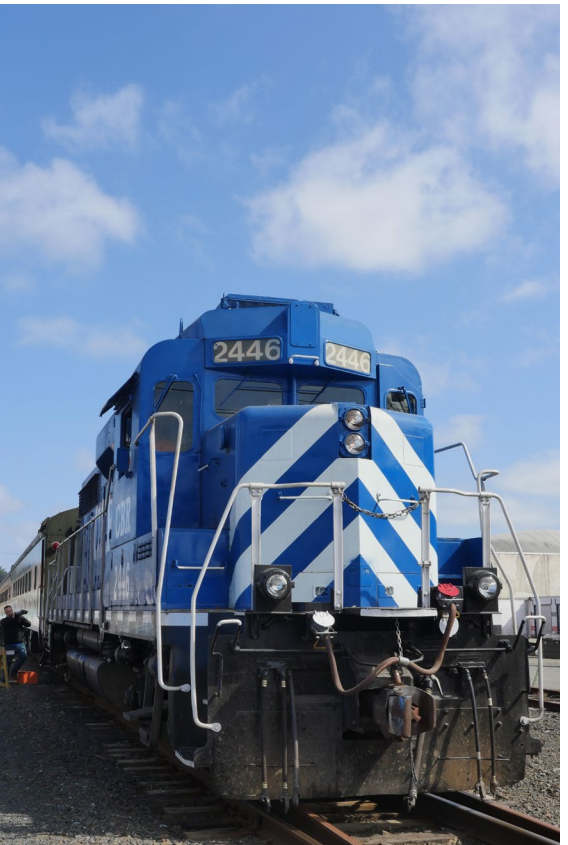
Pictured Above: Coos Bay Rail Link arriving to the train stop