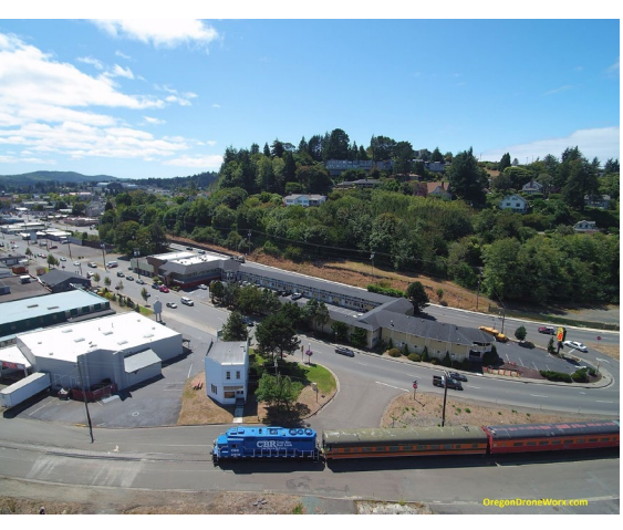
Pictured Above: CBR passenger trains at Railroad Centennial