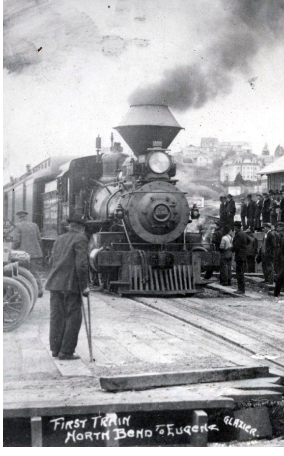
Pictured Above: First Coos Bay rail line train in 1916 leaving North Bend for Eugene.